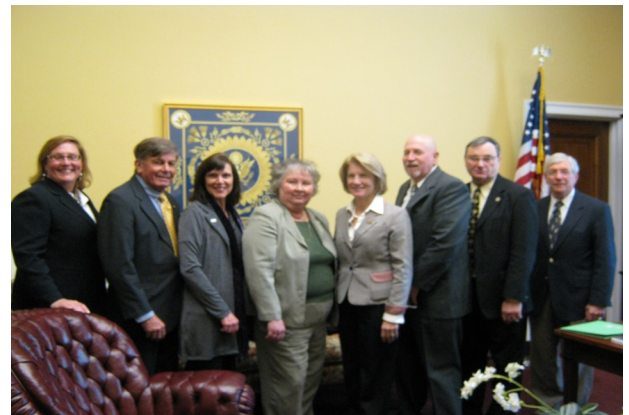
March 2011 The travel team visits with Congresswoman Shelly Moore-Capito (WV)

“There has been little progress recently with regard to the Appalachian highway project because of funding problems, and passage of the Cardin-Casey-Shuster measure would help alleviate that situation. Completion of the route still lies a good distance in the future, but this latest development gives us continued hope.”