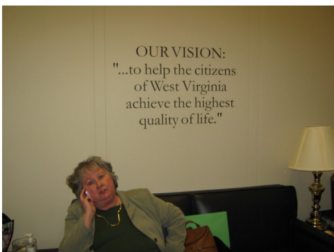
Conducting a telephone interview about their DC trip while waiting in Congressman Rahall's office