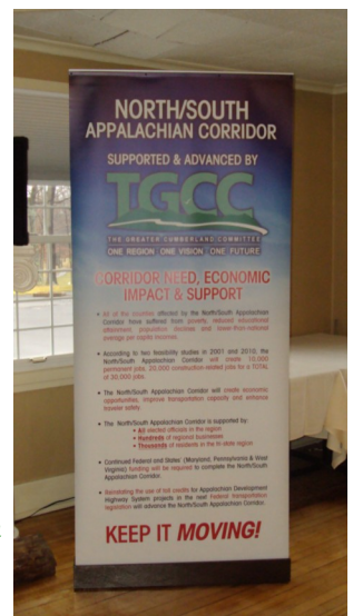
TGCC’s updated display, which was taken to Mineral County Day and PACE.